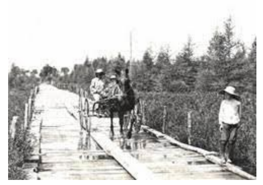
Example of a plank road

Before the 1850s, Wisconsin did not have roads, at least not ones you would recognize. Most travel occurred on footpaths made by Native Americas or along rivers like the Milwaukee or Wisconsin.